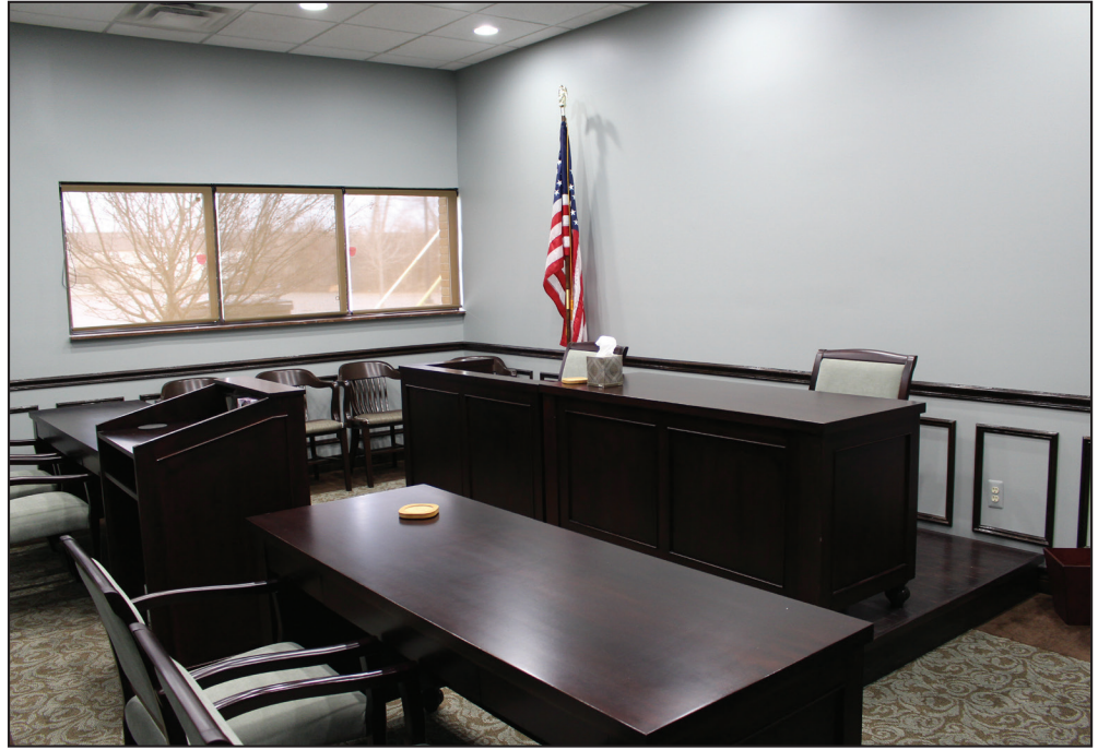
All lawyers at Mantese Honigman PC prepare for cases in a mock courtroom in their Troy office.

“We have a team approach,” he said. “We meet regularly and discuss our